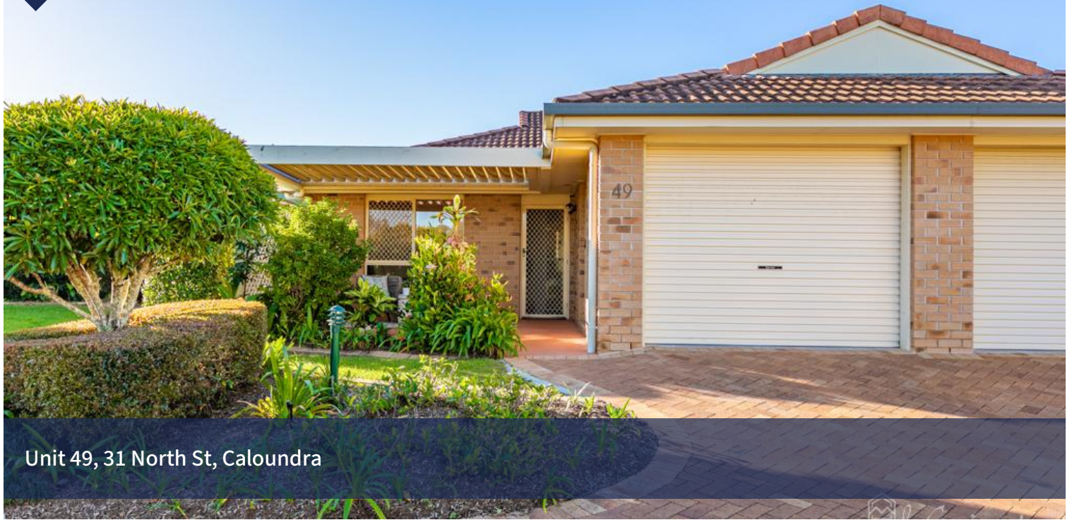
Unit 49, 31 North St, Caloundra