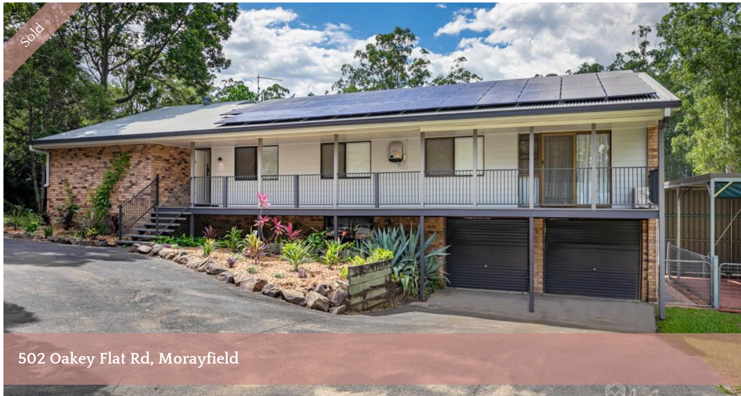
502 Oakey Flat Rd, Morayfield